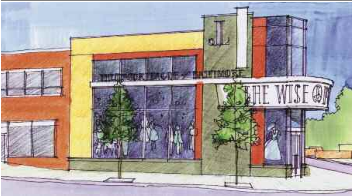
Architectural rendering of the Junior League of Baltimore and Wise Penny renovations.

Thank you for your support of this project. We look forward to completing construction in the next fiscal year!