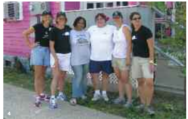
1 A participant enjoys the activities at the Hampden Health Fair. 2 The Larks perform for area children with Santa. 3 Training at a Board Retreat. 4 Rebuilding a Better New Orleans.